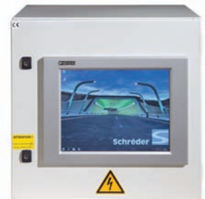
ATS cabinet with visualisation on the front panel.

The ATS controller can operate as a stand-alone unit or can be linked to the main tunnel control system.